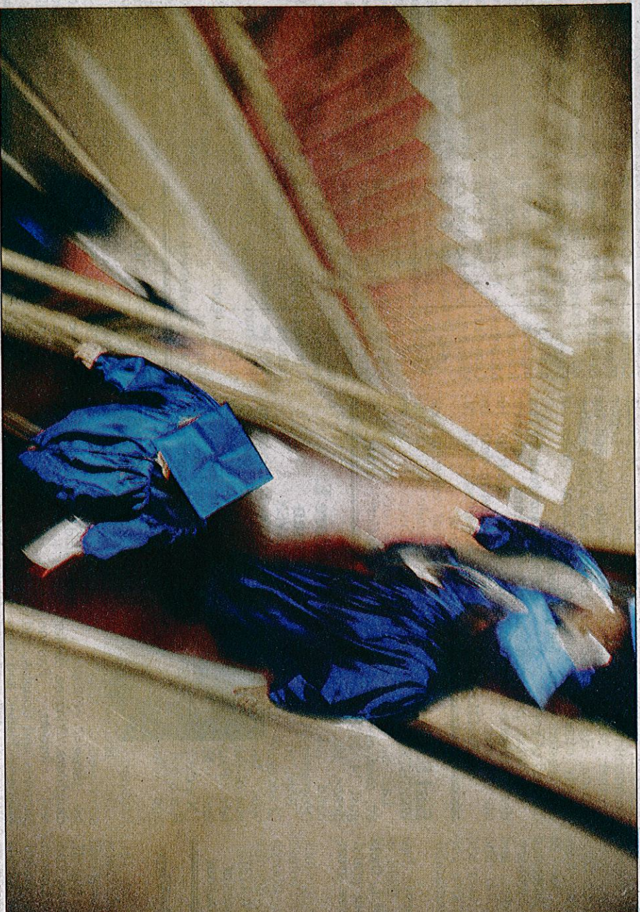
York Technical Institute graduates descend stairs from the staging area to line up outside the Strand-Capitol Performing Arts Center auditorium for Wednesday's ceremony. About 130 students graduated from YTI's York Campus and its Motorcycle Technology Center.